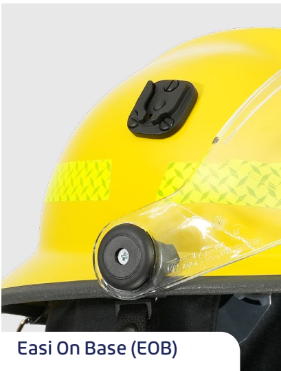
Easi On Base (EOB)